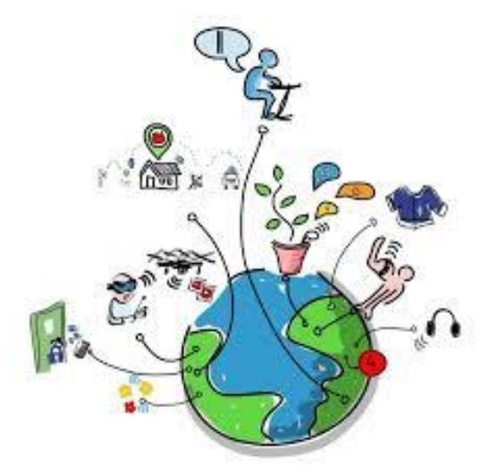
Fig. 1. Internet of Things.

specific locations of a country, their patients also reside closer or at moderate distance from these hospitals. If these patients need physical checkups then they can easily visit these hospitals.