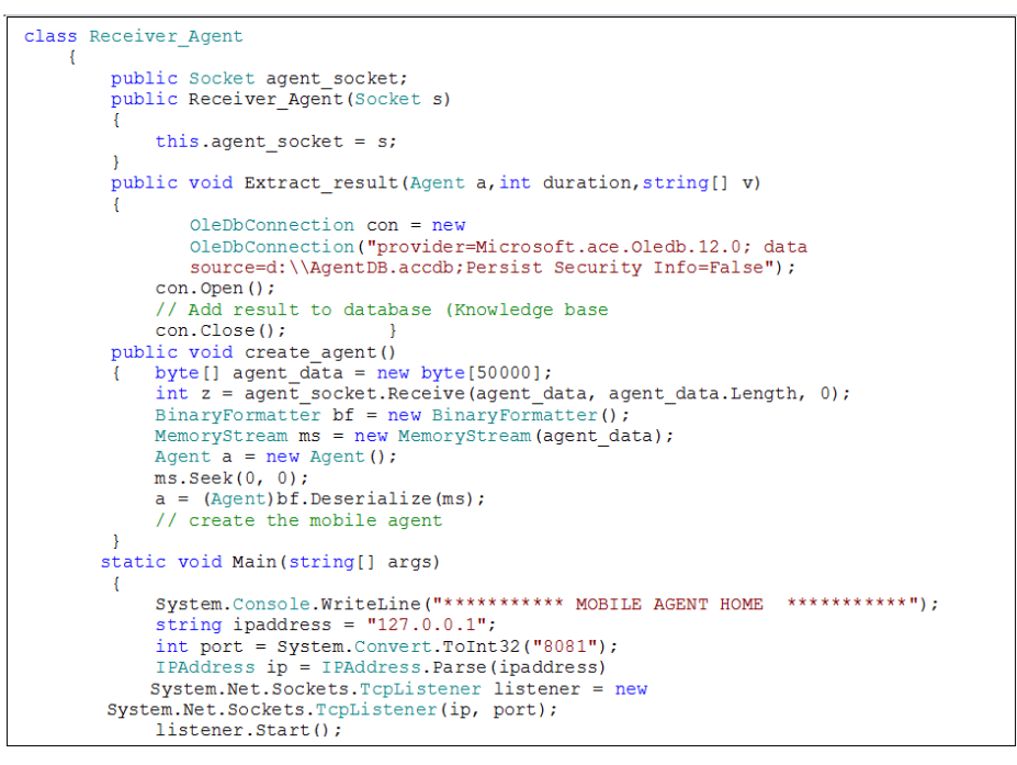
Fig. 4. Mobile agent home (receiver).